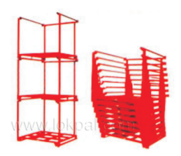
Can be put away in neat pile when not in use.