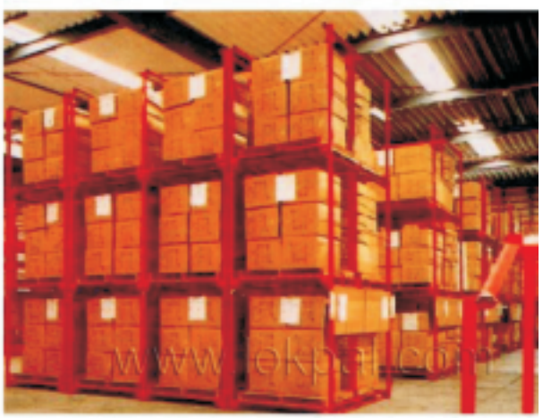
Carton storage in stack racks