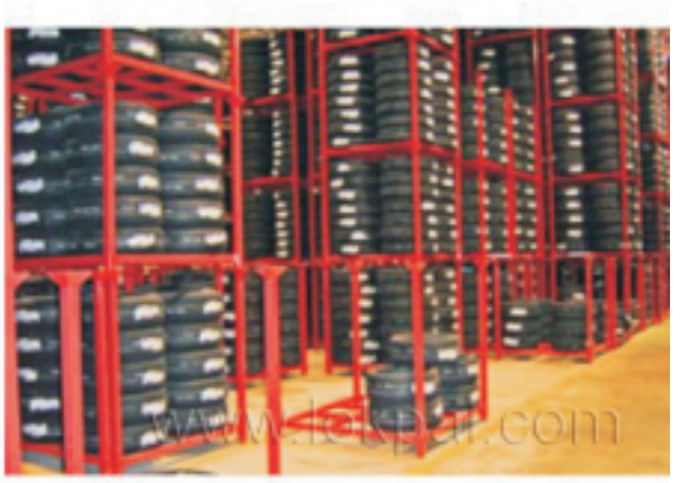
Tyre storage in stack racks